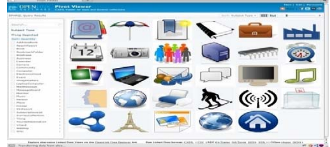
Fig.4 SPARQL Icon Ontology Results

SPARQL Icon Ontology is used for a collection item without its own custom image, which is controlled through the icon ontology defined by schema graph , icon instance data in graph and rules in graph Together, the icon schema graph and instance data define various generic display classes: vpi:Thing, vpi:Person, vpi:Place, vpi:Book, vpi:Music etc and associate an icon with each, e.g. vpi:ThingIcon, vpi:PersonIcon etc. The default icon set generated by describe? S from where {?s ?p ?o } is shown below[23][24].